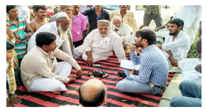
24 Hand pumps / Bore Wells are being installed in two villages of Allahabad under "Grameen Dosti" - Model Village Project in Uttar Pradesh.

HWF has done survey work of 13 villages of district Alirajpur, Dhaar, Khargon and Bhopal under "Grameen Dosti" - Model Village Project' in Madhya Pradesh.