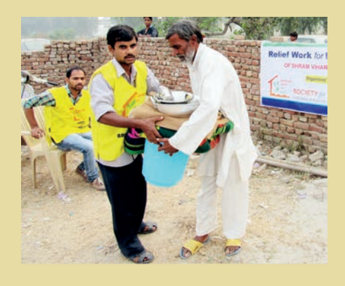
20313 Victims of natural calamities in Chennai, Nepal, Bihar and Delhi benefited from our Disaster Relief Programs.