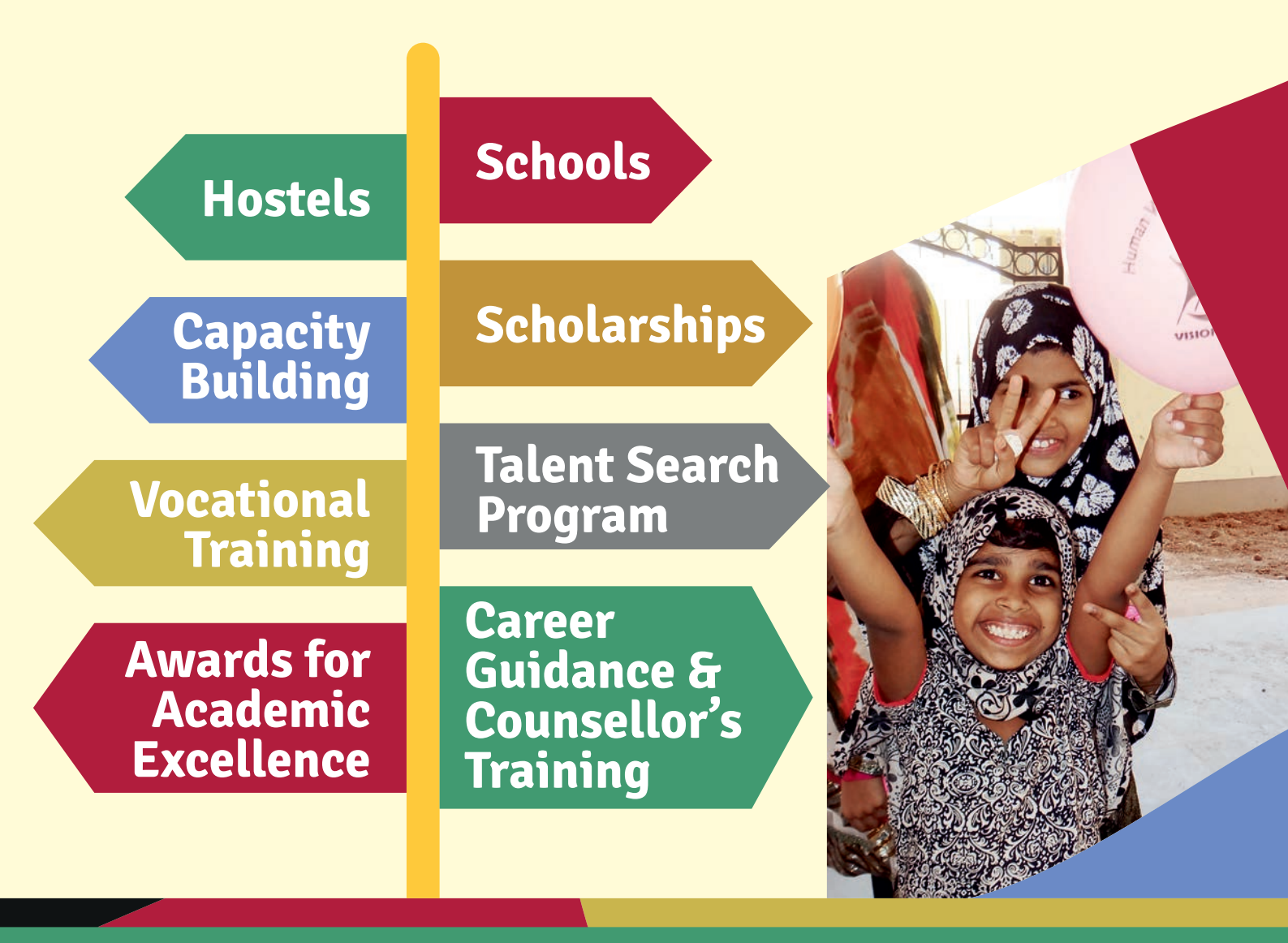
Over 8418 12 CHII DRFN benefited from Construction of 12 Schools, including 4 Scholar Schools directly under the aegis of HUMAN WELFARE FOUNDATION