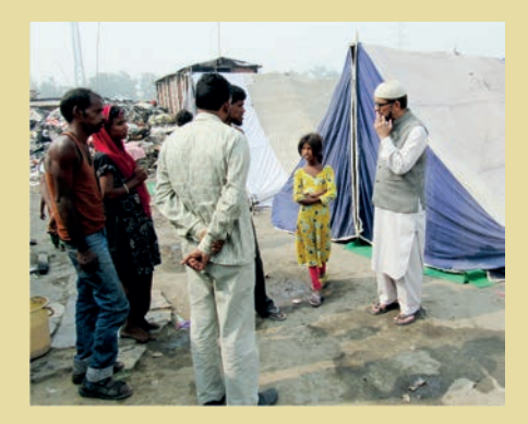
Kashmir Flood Relief Medicines, Food Items, Winter Clothes and Blankets worth Rs. 5 Million