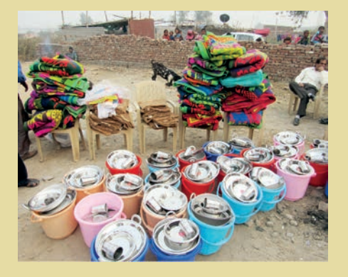
Quick response to devastating Floods in Uttrakhand, Assam, UP and Kashmir