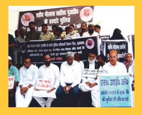
Legal Aid to the Victims falsely fabricated in terror related cases.